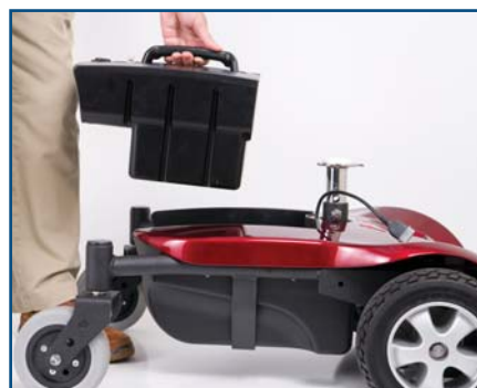
Pull the battery pack out of the base