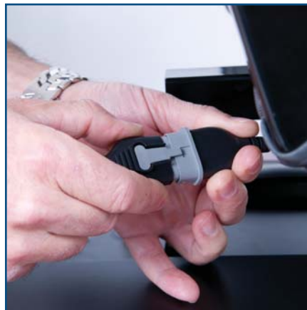
Disconnect the controller wire